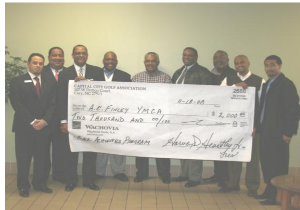
Presentation of Check to the YMCA of the Triangle Y Achievers Program